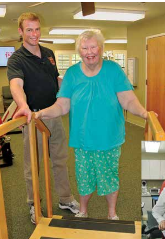
Rehab and Fitness Center